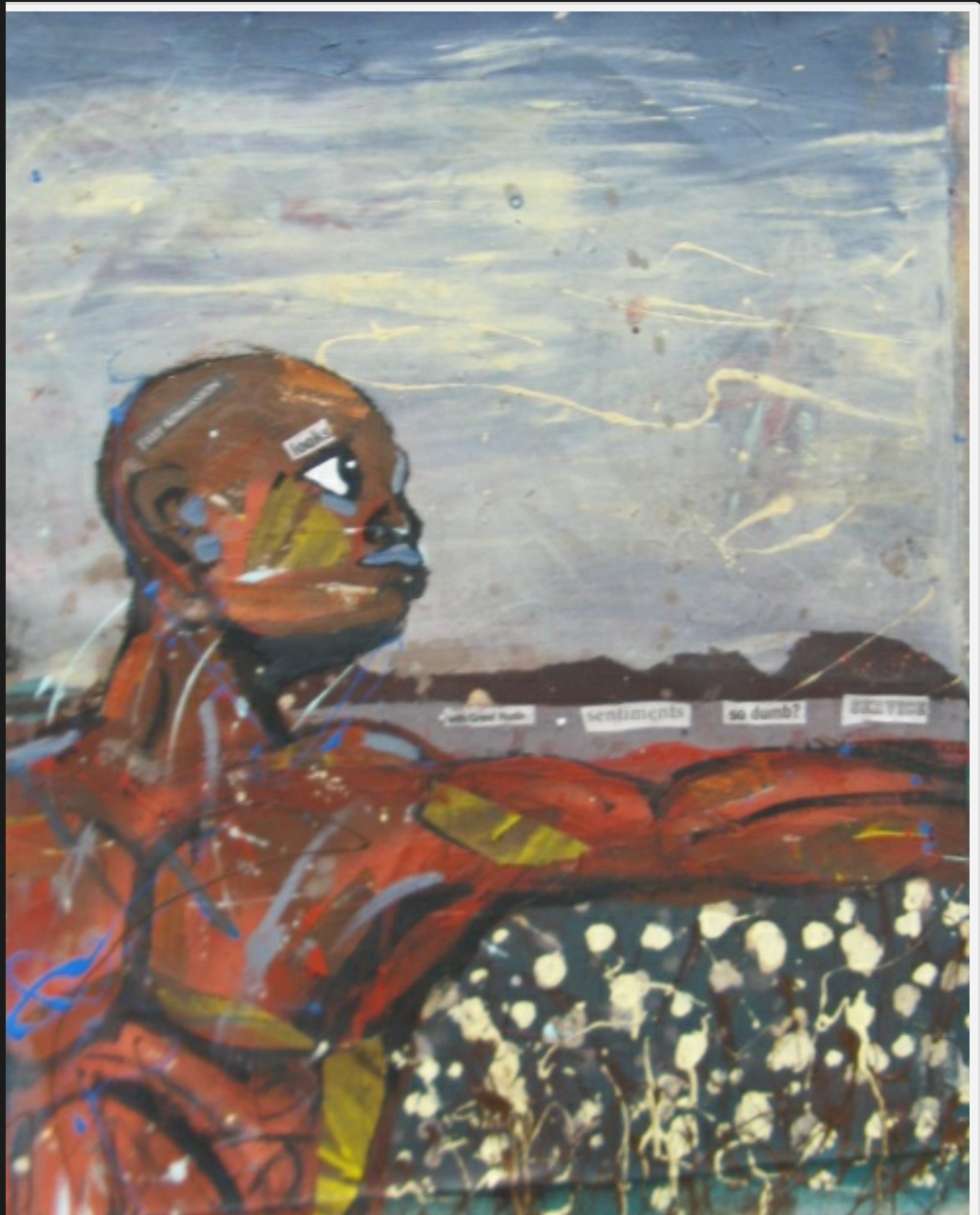
2010 now we pick cotton shopping by Marcellous Lovelace

keep your heart the focus of what you inspire